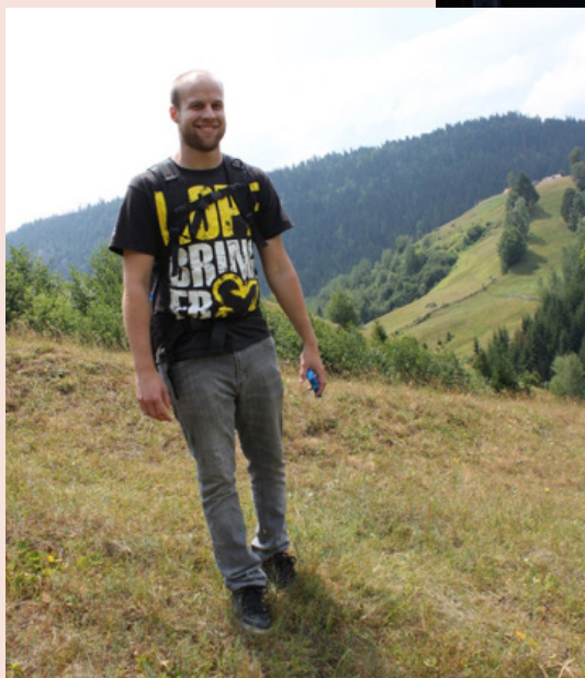
Trekking in the mountains of Kosovo with Albanian New Testaments