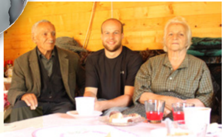
Visiting a Kosovar-Albanian family and giving them a New Testament

One Sunday she was walking to church on a dusty continued on page 2