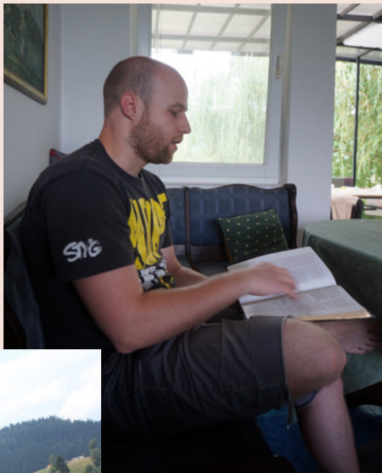
Leading a small group Bible study