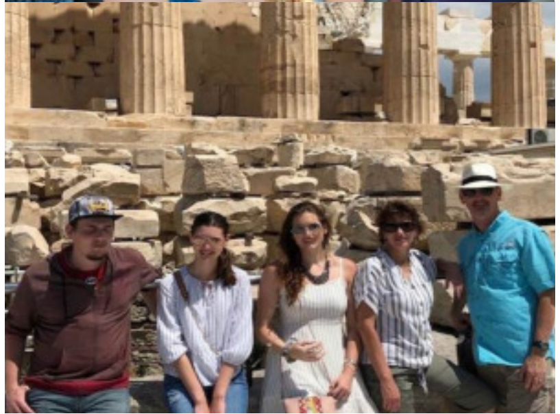
Celebrating Mother's Day with the family (pictured at top), On vacation with the family in Greece (pictured above).