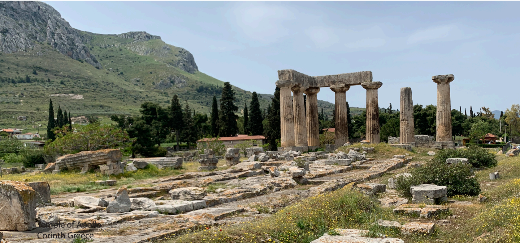
Temple of Apollo Corinth Greece